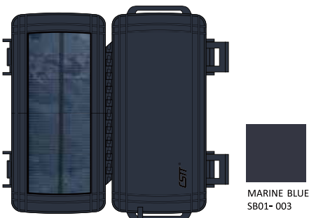
MARINE BLUE SB01-003